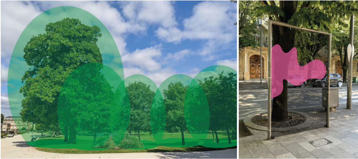
Figure 1: Examples of situated visualizations envisioned during the workshop. On the left, each green bubble represents the positive effect the trees have on the atmosphere and on oxygen production. On the right, the proportion of carbon dioxide in the air is displayed and updated every time a vehicle passes behind.