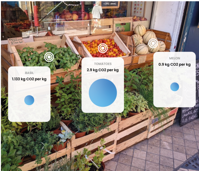
Figure 3: Example of an envisioned situated visualization informing purchasing decisions by allowing the comparison of different food items based on the carbon dioxide footprint. It is displayed directly near the corresponding food products.

Although the knowledge viewers gain may help them make decisions later in life (e.g., vote for a specific public policy), the visualizations were not meant for immediate personal action. Examples include visualizations showing how much CO 2 is stored in a specific tree or how much it can capture over a year (see Fig. 4).