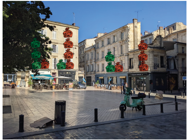
Figure 5: Example of an envisioned situated visualization increasing awareness and representing the amount of recycling trash (green) compared to regular trash (red). It is placed onto buildings from which the data is retrieved.

have the ability to promote positive social feelings and behavior, but, because they can facilitate comparison between people and groups, they also have the ability to increase social pressure.