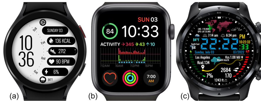
Figure 2: Example of sports smartwatch faces. Watch face design by: a) JN-Rolling (JN-WatchFaces), b) New Design (Enid Rodriguez), and c) Voyager GPS-01RB Sport 24H (Luke Time) from Facer App [45].